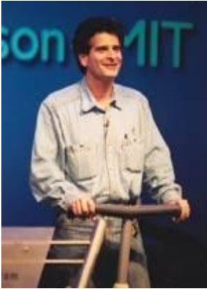
FIRST Founder, Dean Kamen

Beach Cities Robotics is part of FIRST (For Inspiration and Recognition of Science and Technology), which was started by world-famous inventor Dean Kamen. FIRST was started in 1989 to get young people excited about science and technology by pairing students with professional mentors. The first competition was held in 1992 in a high school gymnasium, with 28 high school teams. Over 13,000 schools in the United States and 37 other countries are now involved in FIRST . FIRST Robotics Competition (FRC) and FIRST Tech Challenge (FTC) are for high school students and the FIRST LEGO League (FLL) is for people your age! There is even the FIRST Junior LEGO League for kids ages 6 to 9.